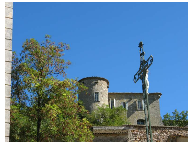
La Bastide d'Engras

The village itself, dominated by a medieval chateau, is basically a farming community with a post office, a mairie and a bread van that comes through every morning. The local wine cooperative is not to be missed as it produces excel-