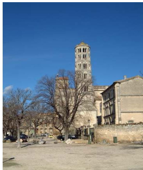
Uzès: tour Fenestrelle